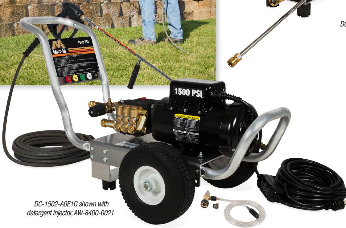
DC-1502-A0E1G shown with detergent injector, AW-8400-0021